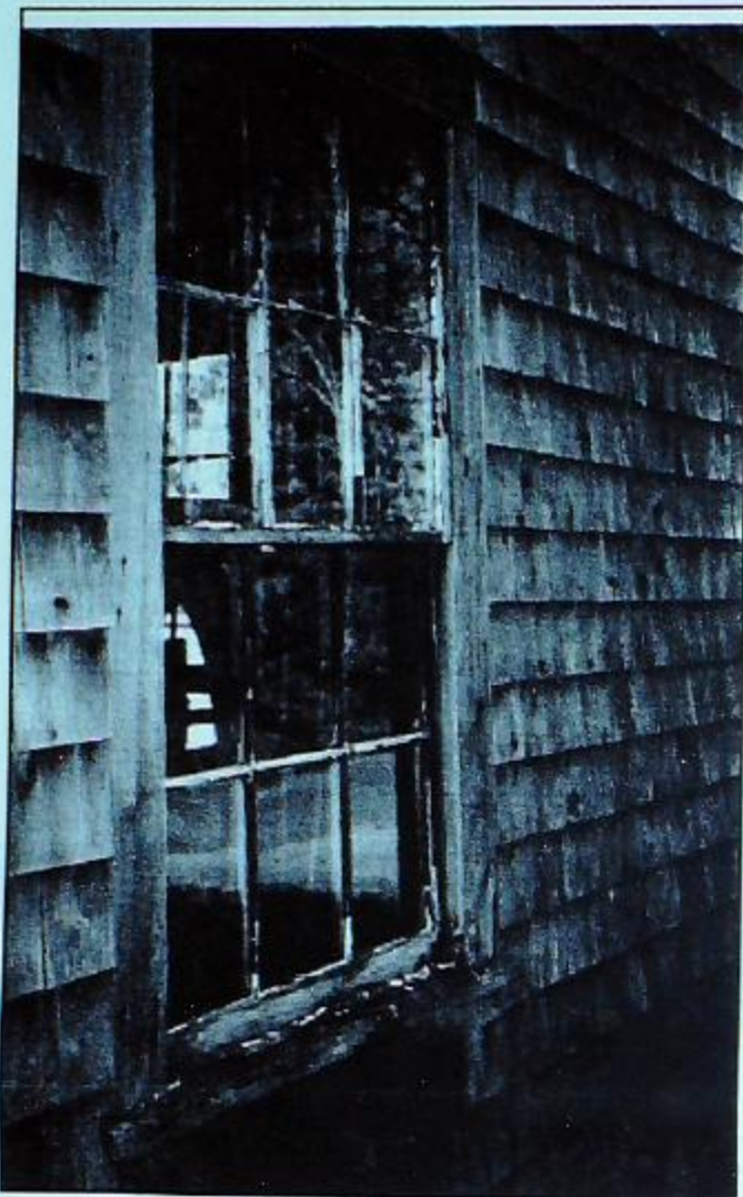
Even the glories of autumn reflected in the shop's window above can't hide the marked deterioration.

Would you like to give a loved one a unique gift or create a historical memorial to a departed friend or relative? For some time it has been apparent that the Blacksmith Shop Museum's windows are in trouble. As the photo to the left clearly shows the casings need to be re-built and the windows themselves replaced. But with 11 windows to re-do the $300 each price tag is beyond the Society's funding ability at the current time.