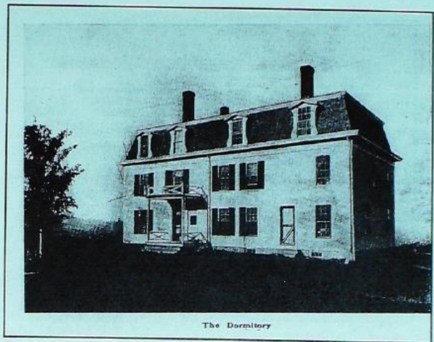
Foxcroft Academy Dormitory, 1908.