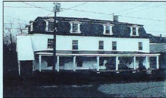
The Chamberlain House/Dormitory today.

What the future holds for this once grand home is hard to say. But we can wonder if those with fanciful imaginations or in tune with other times ever hear the echo of young women's laughter on a spring evening as reminder of the old building's happier days.